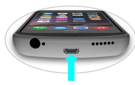
Support Micro USB Charge & Sync